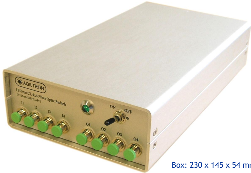
Box: 230 x 145 x 54 mm

Driving kit with variety of control interface, such as USB, RJ45, RS232 with Windows™ GUI, is available.