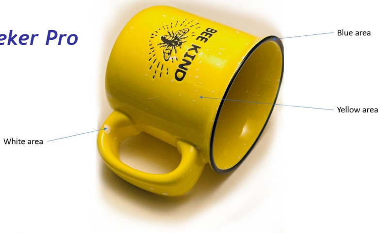
Raman Spectrum of Different Area

Tested on a 785nm PeakSeeker Pro at 300mw laser