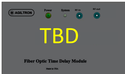
Front Panel (TBD)

Typical 10U 19" rack for 16-19 bit system with the maximum delay of 0.1ms.